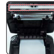
Ceramic Auto Cutter