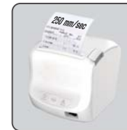
High Speed Printing