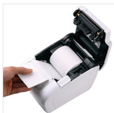
Easy Paper Loading Auto Cutter