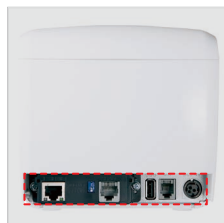
Many Interface Options