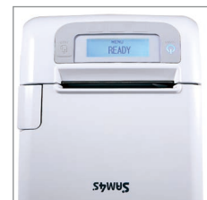
Automatic Display Pivot Function for Wall Mounting