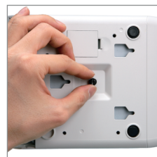
Easy Assembly and Disassembly